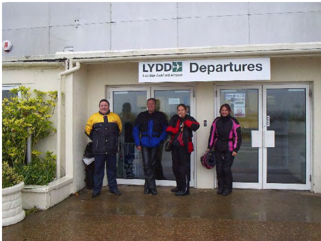
Ride out May 13