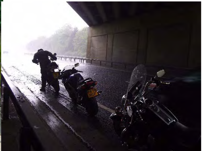
Below: on way back from Hastings May 7th