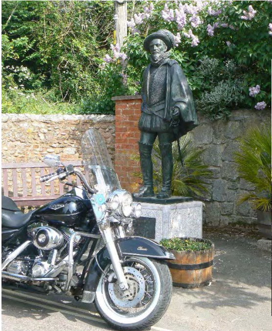
Left: Statue of Raleigh. Devon May 6