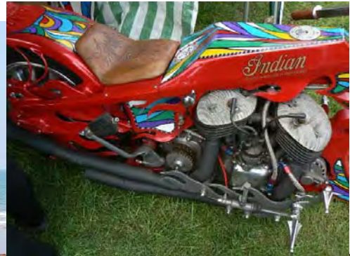
Right and middle right Chris Irelands Indian and nice Chop seen at creatures rally