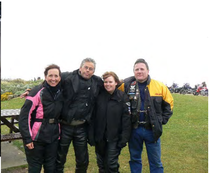
Hastings Bank holiday Monday