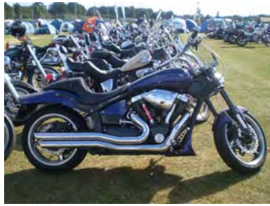
More from Kent